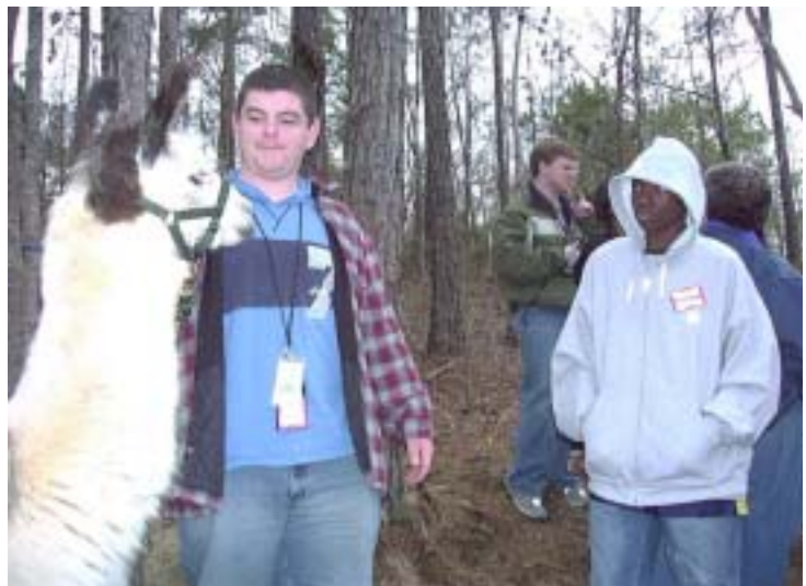
Deaf Students and the Llama at SIFAT (see page 12)